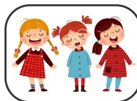
ELEMENTARY SCHOOL CONCERTS AND ASSEMBLIES