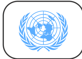
MUN AND MC