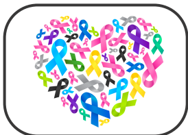
HEALTH AWARENESS DAYS